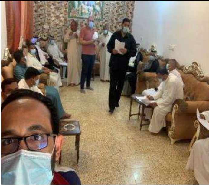
Public Consultations at Albu NileVillage