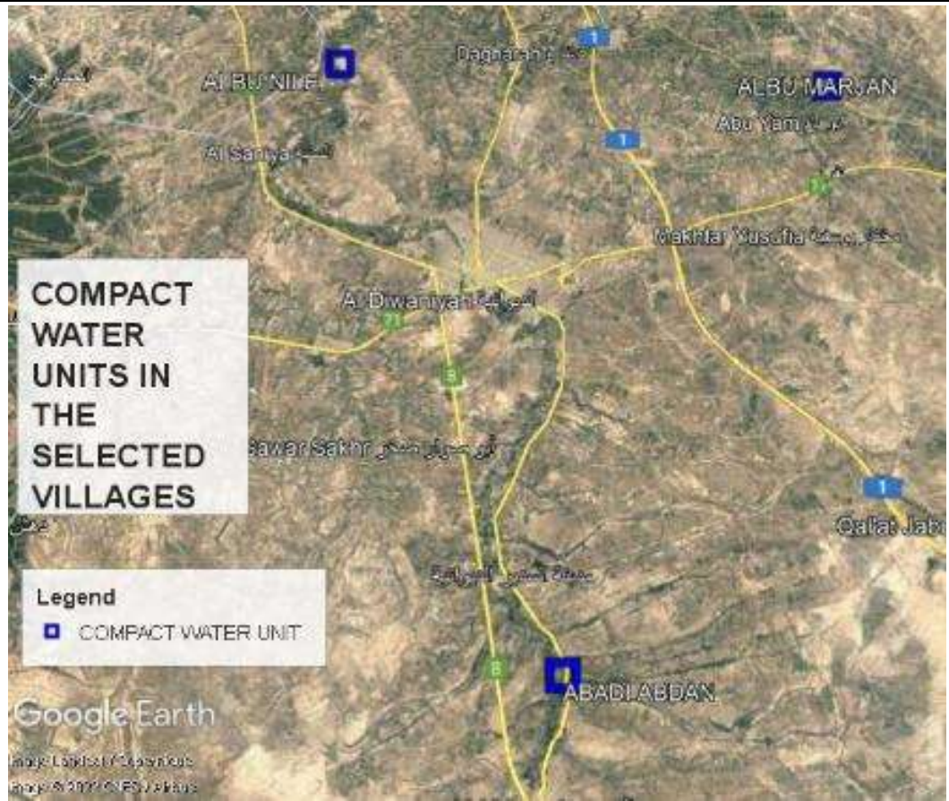
COMPACT WATER UNITS IN SELECTED VILLAGES