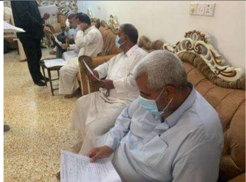
Public Consultations at Albu Nile Village