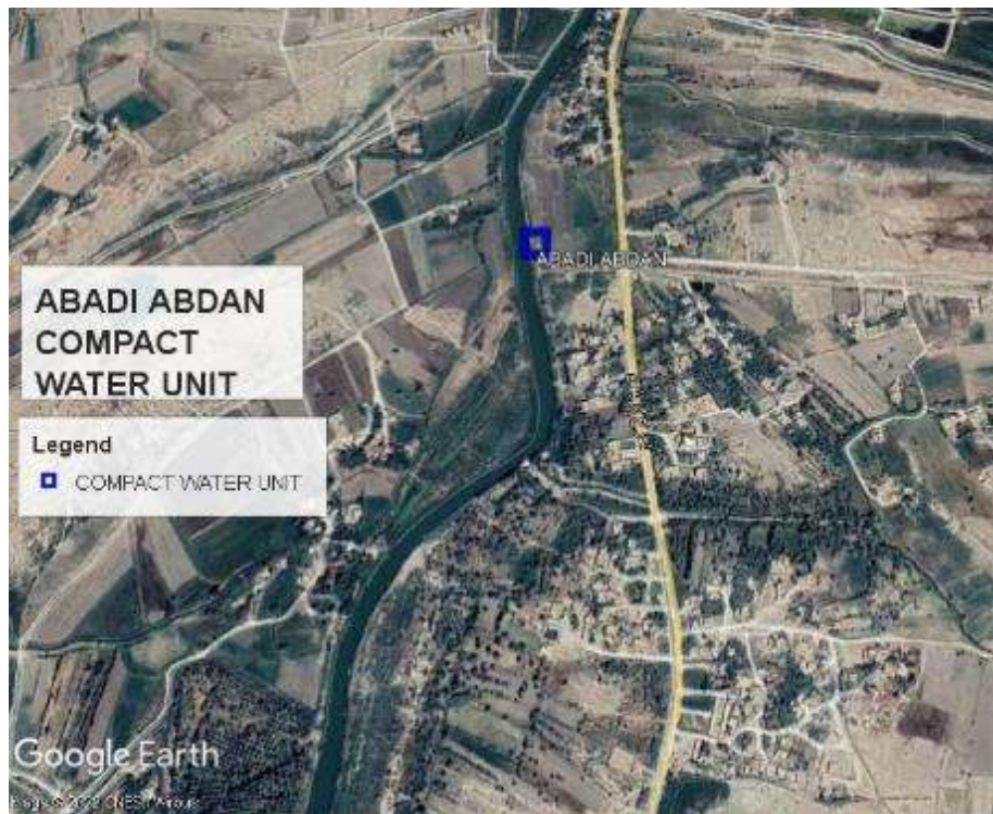
ABADI ABDAN COMPACT WATER UNIT