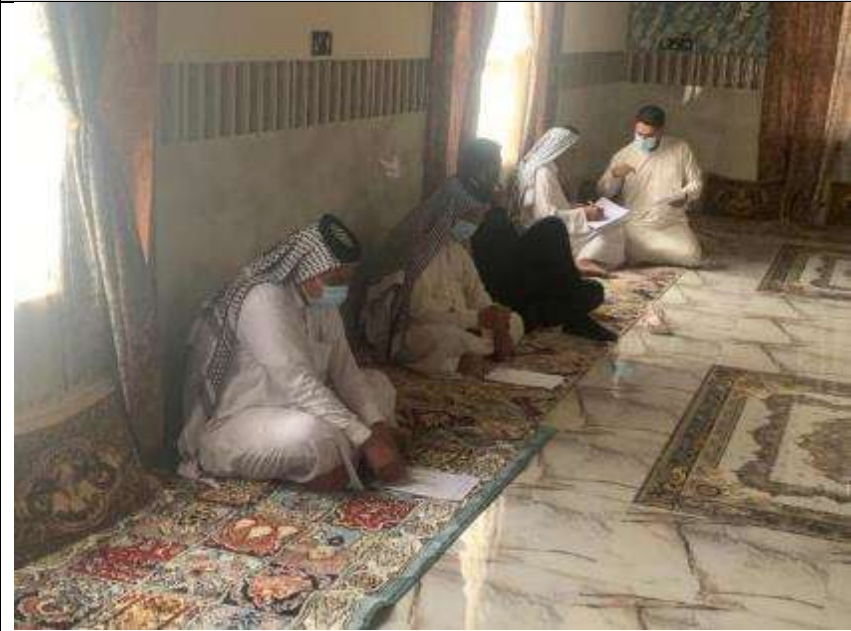
Public Consultations at Albu Marjan Village