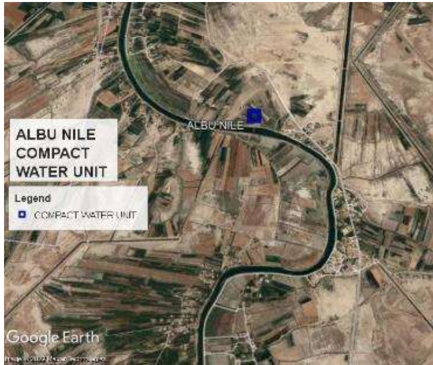
ALBU NILE COMPACT WATER UNIT